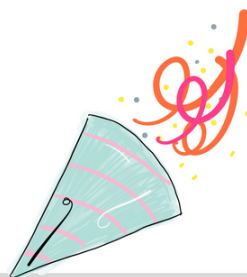
The Shin Dig