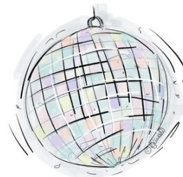
The Blow Out